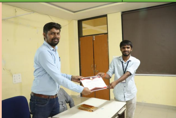
3 rd Sem: Rank 1