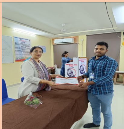
5 th Sem: Rank 1