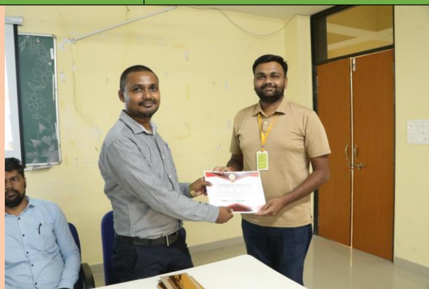
1 st Sem: Rank 1