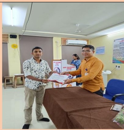
5 th Sem: Rank 2