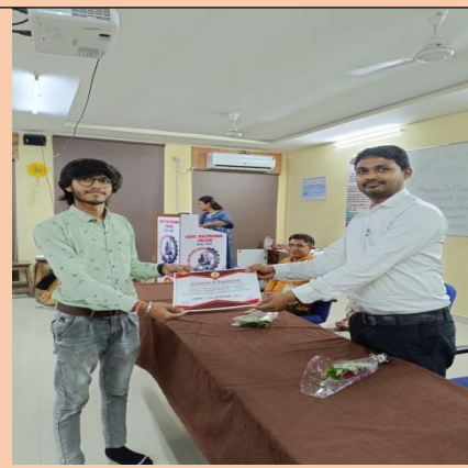
5 th Sem: Rank 3